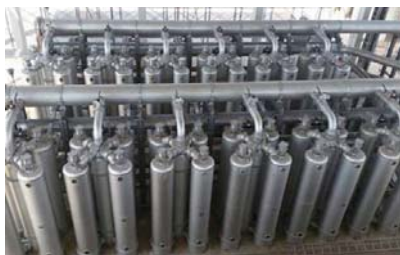
WTP-P 80,000 (Thailand Prachinburi Industrial Area)