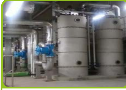
Samsung Electronics 32,600 m 3 /d