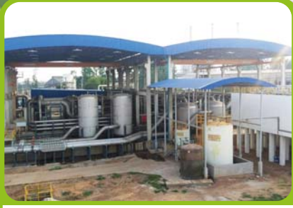
304 Industrial Park 160,000 m 3 /d