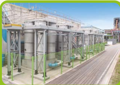
POSCO Rolling Mill 40,000 m 3 /d