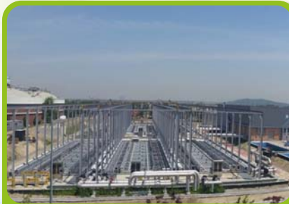
Bucheon 900,000 m 3 /d